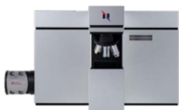
Sophisticated high performance RAMANforce

The highest performance Raman of Nanophoton has evolved dramatically. Its perfect resolution and sensitivity provides the best Raman imaging ever.